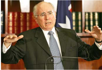
John Howard... under fire for meeting with the Exclusive Brethren