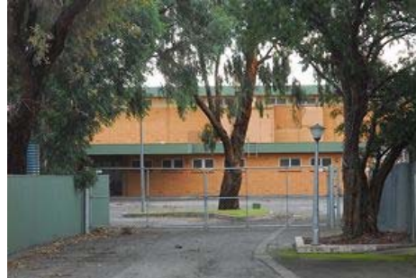
Exclusive Brethren property at Mary St, Unley.