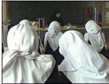
The two groups say they represent a wide range of schools

The government has approved the setting up of a new independent inspectorate which will mean the schools involved will not be checked by Ofsted.